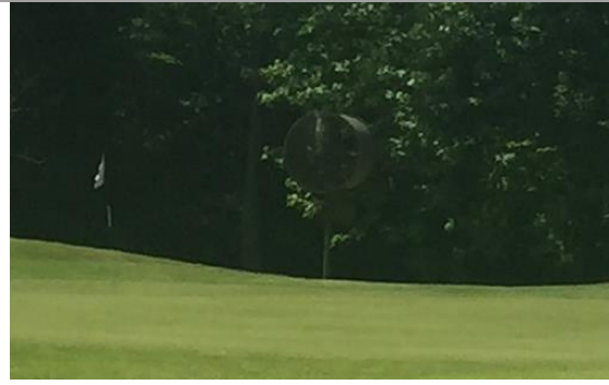
Fan on #15