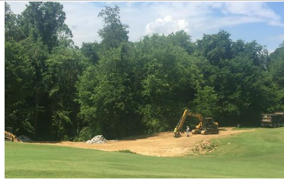
Construction on creek on #3