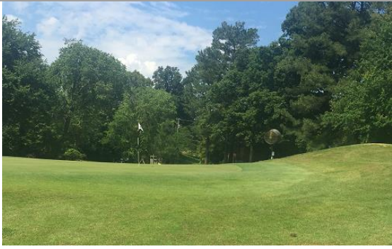
Fan on #3