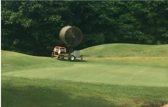
Portable fan on #13